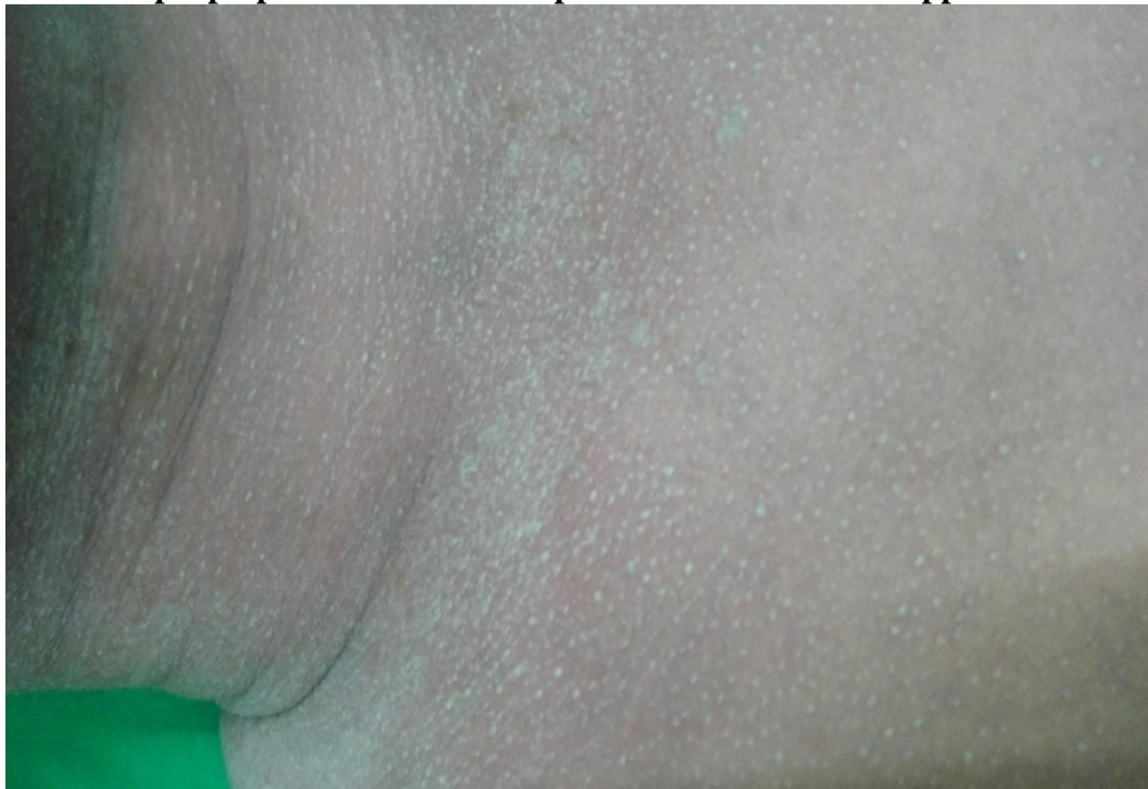
Figure 1 Multiple pinpoint non-follicular pustules over neck and upper trunk

His blood tests showed neutrophilia, eosinophilia and lymphocytopenia, raised erythrocyte sedimentation rate (50 mm at 1 st hour), serum calcium (8.4 mg/dl), aspartate transaminase (44 IU/L) and elevated C-reactive protein. Other blood parameters were within normal limits. He was subjected to investigations to rule out common infective causes of fever (malaria, typhoid, dengue, chikungunya). He tested positive for chikungunya by IgM antibody serology. Ultrasound abdomen was insignificant. Pus culture and sensitivity from pustules was sterile. Histopathology of the skin biopsy specimen revealed spongiosis, intraepidermal and subcorneal neutrophilic infiltrate along with perivascular mixed inflammatory infiltrate in the dermis consistent with the diagnosis of AGEP (figure 2).